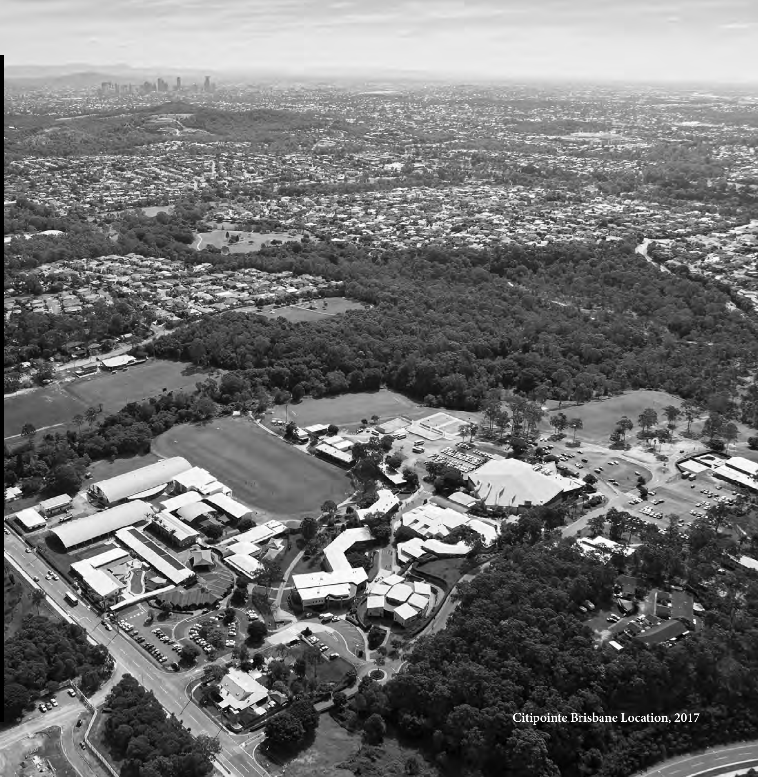
Citipointe Brisbane Location, 2017

Citipointe Church is now one of Australia's largest and most influential churches with the mission to "Unmistakably Influence our World for Good and for God" .